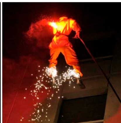
Pyro Wall Rappel Stunt

In our ongoing quest to create new and exciting work we are always on the look out for new environments in which to play. Last year our rigging team invited some of our dancers and aerialists up onto the side of a tall building to start working on vertical performance and 'wall dancing' techniques. This was the start of something new for us. Now we are creating dynamic performances that take place entirely on the sides of buildings or on horizontal 'highlines' rigged above. This is a great way to create a spectacle show with no stage and create a real buzz. Click here for more information.