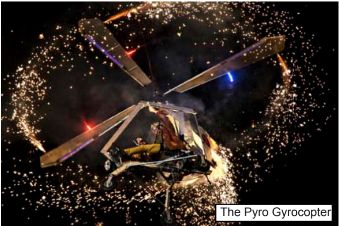
The Pyro Gyrocopter