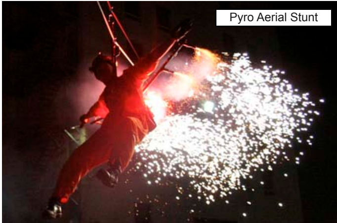
Pyro Aerial Stunt

Come and visit us at www.circusorange.com !!!