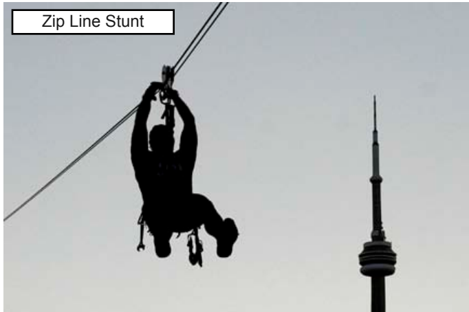
Zip Line Stunt