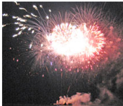
Fireworks at the EX

For 18 days this summer Circus Orange had the opportunity to team up with our good friends at Ampleman Pyrotechnics and help put on a 12-minute fireworks show every night at the Exhibition in Toronto. Ampleman is one of the oldest and most respected fireworks companies in Canada and we have worked with them in the past at events such as Le Mondial SAQ in Montreal. When the chance came up to be the local partner for their fireworks run at the EX we jumped at it. This was a great chance for us to share knowledge and techniques between our two companies and put on an incredible show in the process. Overall the run was a massive success and many people in the crowd were heard saying that it was the best display that they had seen in years.