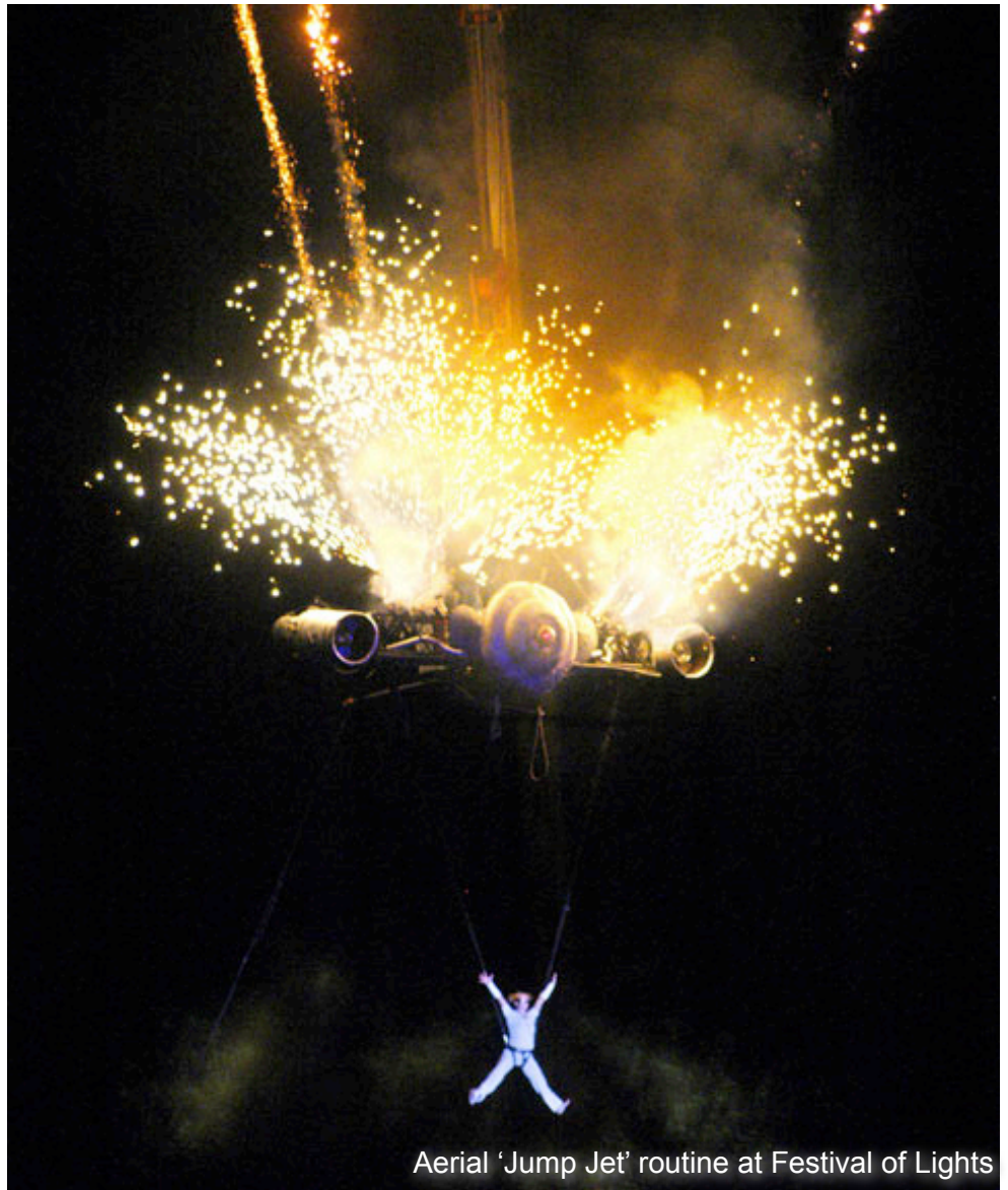
Aerial 'Jump Jet' routine at Festival of Lights

Here it is, just in time for fall. Issue number two of the Circus Orange Newsletter. It has been a very busy summer and our winter season is booking up fast as well. We thought we better get this issue out before we were too busy performing and blowing things up to write about what we have been up to. Please share this newsletter among friends and pass it along to people who you think might be interested. Enjoy!