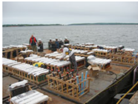
Fireworks Setup On the Barge

For the second chapter of the show we shot high-level proximate effects off the roof of the Delta hotel right downtown adjacent to the park where the festival takes place. This was a three-minute assault of effects shooting as high as 300 feet in the air but leaving no fall out whatsoever so that we could shoot in close proximity to the audience.